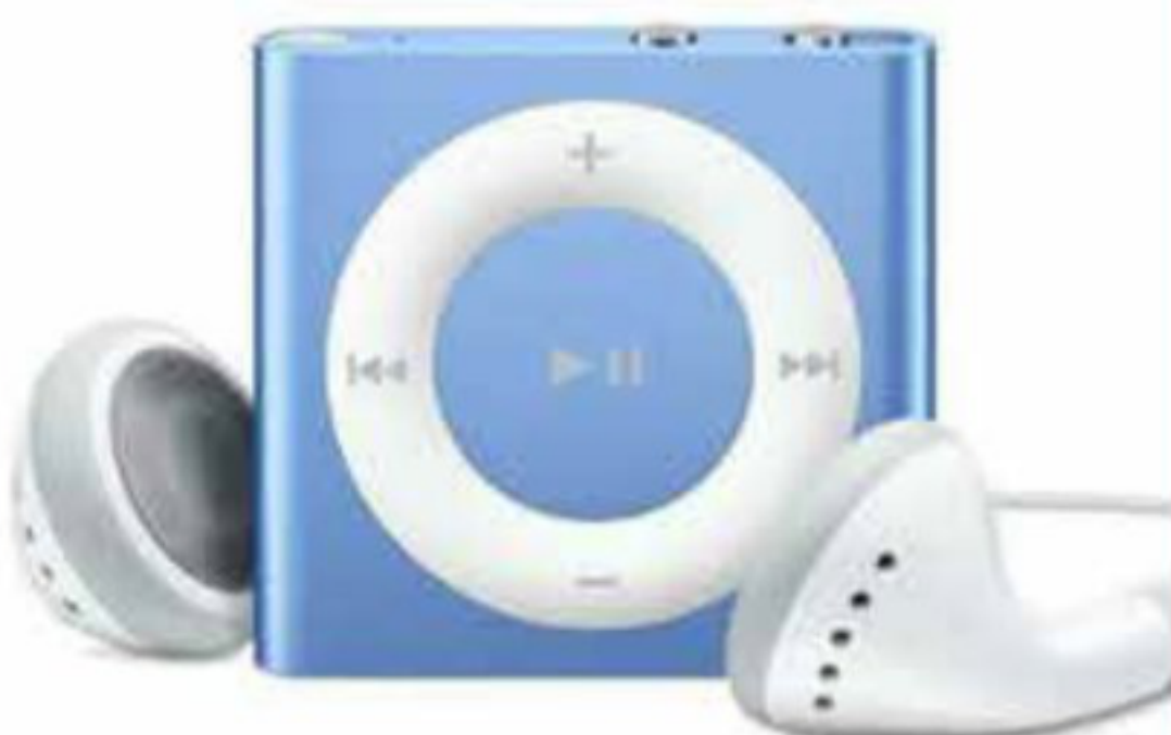
◀ Apple IPOD